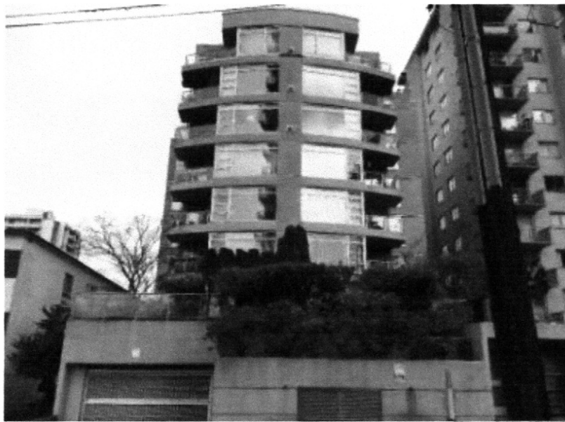
Dated: November 30, 2016 at Vancouver, BC