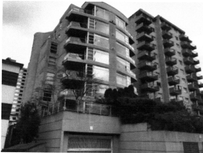
Strata LMS 280 - Chateau Comox