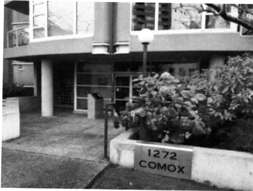
Strata LMS 280 - Chateau Comox